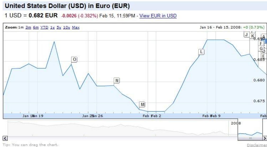
Figure 1 the fluctuations in exchange rates between US dollar and Euro.

The value of the U.S. dollar in relation to the Euro varied from 0.672 to 0.690 as shown in figure 1 that was recorded from January 16, 2008 to February 15, 2008. The exchange rate between U.S. dollar and Euro changed in response to change in a variety of economic conditions that change the demand for or supply of dollars in European exchange markets. Six major influences on demand for and supply of dollars that determine U.S. Dollar/Euro exchange rate are: (1) European Union's demand for U.S. exports (2) U.S. demand for imports from European Union (3) Real Interest rates in the U.S. relative to E.U. (4) Profits of direct investments in the U.S. vs E.U. (5) Expectations of future price of U.S. dollar vs E.U. (6) Price level of U.S. vs E.U.